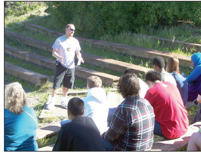
Ziggy in action.