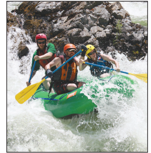
Ziggy at DAO.