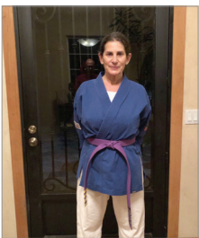
I love Karate.